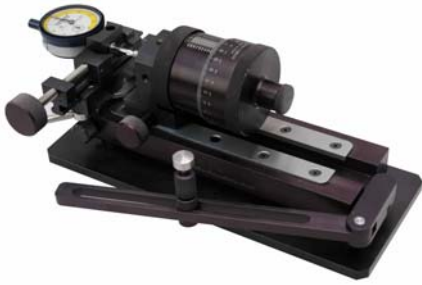
CG-1000 Calibrator Gage