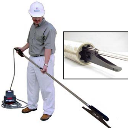
Inspects Internal Diameters of Stators