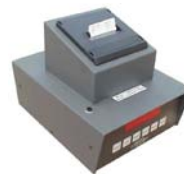
Digital Readout and Printer