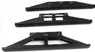
Stator Bore Gage Extension Shoes