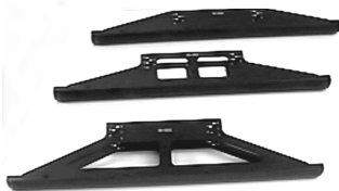
Stator Bore Gage Extension Shoes