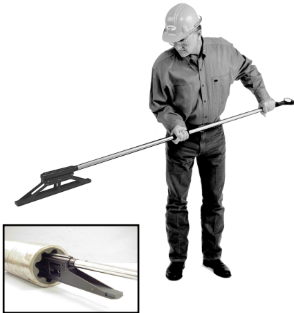
Inspects Internal Diameters of Stators