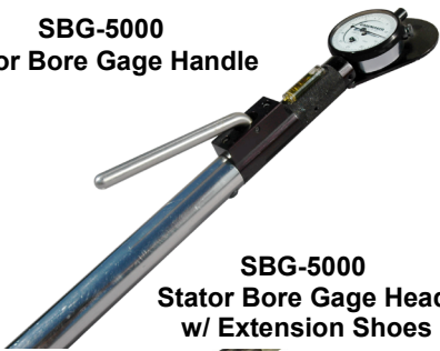
SBG-5000 Stator Bore Gage Head w/ Extension Shoes