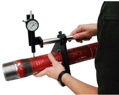
Using the SG-8001

API Spec 5CT requires pipe ends to be inspected for end hook.