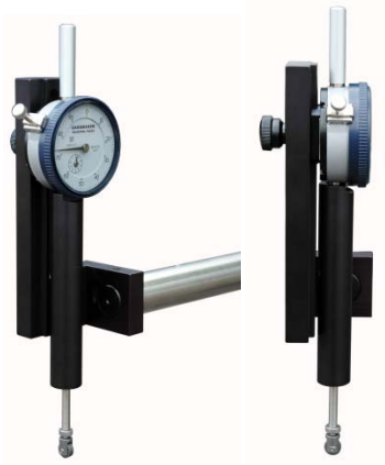
SG-8001 with Adjustable Indicator Post