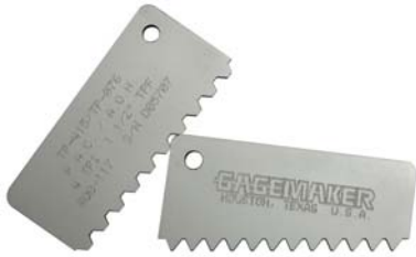
TP Series Thread profile gages quickly identify API thread forms