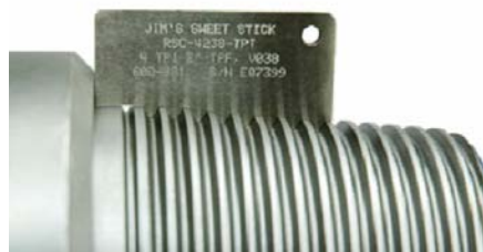
TP-JSS Series (Jim's Sweet Stick)